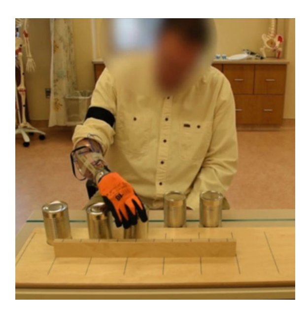
Fig. 1 A subject performing one of the Jebsen Taylor test of Hand Function subtasks

As mentioned above, the Pisa/IIT SoftHand was initially designed as a robotic hand intended for use on humanoid robots. The embodied intelligence of the SoftHand's mechanics suggested it had potential as a prosthetic hand that would not require complex control input from the user. In order to test this theory, it first had to be modified to be more suitable for prosthetic applications. In particular, the overall size of the hand was reduced to better approximate a large male hand. Further, the electronics were reduced in size, modified to interface with commercial electrodes (Otto Bock, Germany), and moved to the back of the hand to create a more compact design. To better interface with a prosthetic socket, a quick disconnect style wrist component was developed that allowed manual pronation and supination; further, the wrist was flexibly connected to the SoftHand Pro to allow passive wrist flexion and extension. Finally, a smaller and lower voltage motor was incorporated to allow use of a smaller, lighter-weight battery. For each subject, a custom prosthetic socket was built by a certified prosthetist.