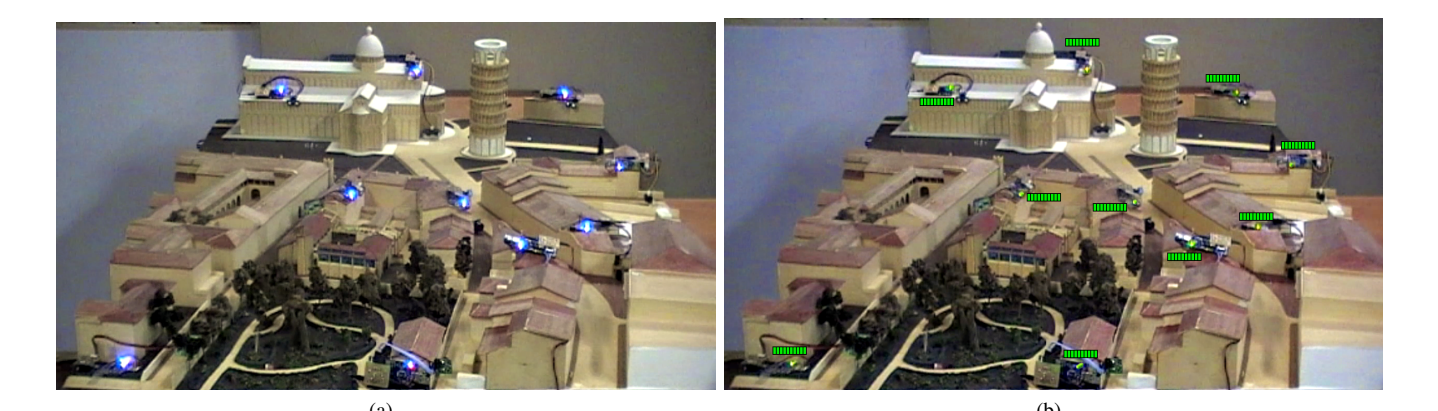
Fig. 3. Snapshots of the four main phases of the experiment: (a) execution of the SRNP, (b) intrusion detection mode, (c) detection of the intruder by agent A_1 , (d) the intruder has moved in an area that is out of every agents' range. A colored flag of 10 squares represents the alarm state X_i of a generic agent A_i and shows its knowledge about the presence of an intruder in every visibility areas.

is possible, and thus the length of every round is set to 1 sec. Although the current implementation of the communication scheme requires the agents' pre–synchronization (via e.g. the solutions in [18], [19]), this does not affect the general applicability of SRNP.