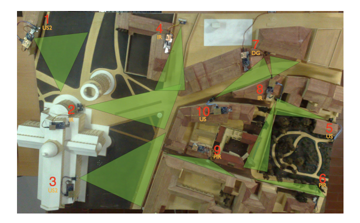
Fig. 1. Scale model of the area nearby Pisa's Leaning Tower. Green cones represent the visibility areas of every agents.