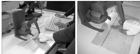
Fig. 1 – Experimental setup during the training (left) and a zoom view while a volunteer touches a 45° ridges pattern during test (right).

A PHANToM® Desktop [6] (PHD) from SensAble Technologies was used to perform the experiments. The PHD allowed us to easily evaluate and store kinaesthetic variables (position and velocity) of the hand during active exploration.